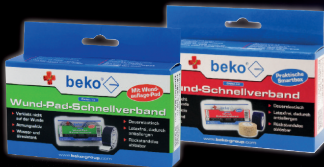
Packaging with Euro perforation